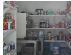
Items in the Reuse shed are available at no charge

This facility is for hazardous waste coming from households only. If your business generates hazardous waste a list of commercial disposal facilities is available from the household hazardous waste attendant or at the scale house.