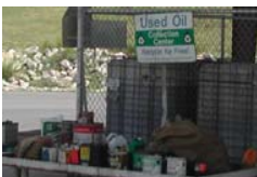
Used oil drop off