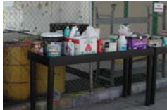
Household hazardous waste collection area